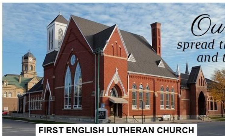
FIRST ENGLISH LUTHERAN CHURCH Wapakoneta, Ohio