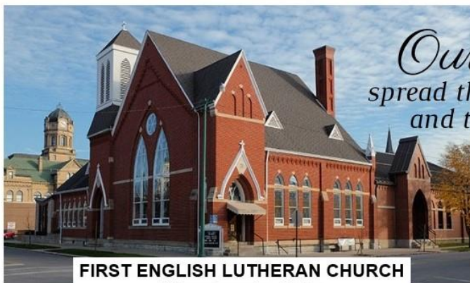
FIRST ENGLISH LUTHERAN CHURCH Wapakoneta, Ohio