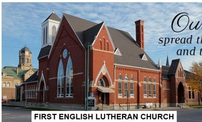
FIRST ENGLISH LUTHERAN CHURCH Wapakoneta, Ohio