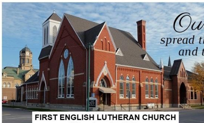
FIRST ENGLISH LUTHERAN CHURCH