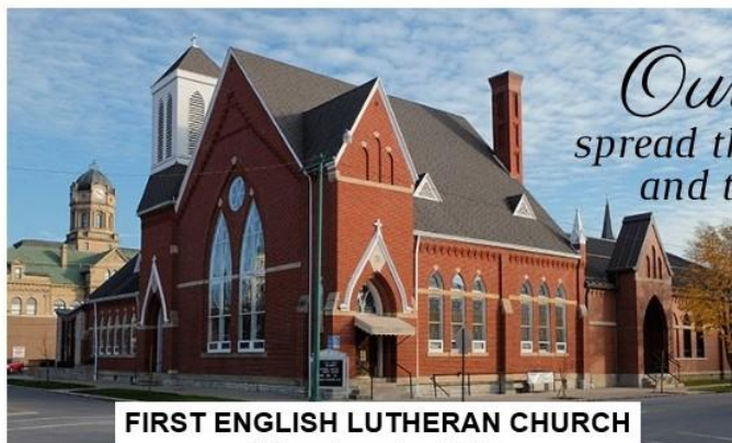
FIRST ENGLISH LUTHERAN CHURCH