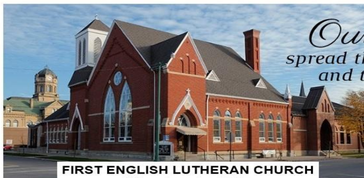
FIRST ENGLISH LUTHERAN CHURCH Wapakoneta, Ohio

Our mission is to spread the Gospel of Jesus Christ and to love one another as He has loved us.