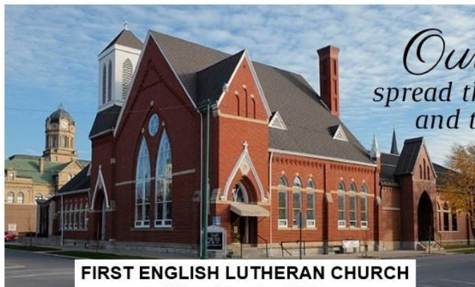
FIRST ENGLISH LUTHERAN CHURCH Wapakoneta, Ohio