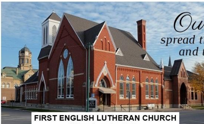
FIRST ENGLISH LUTHERAN CHURCH Wapakoneta, Ohio