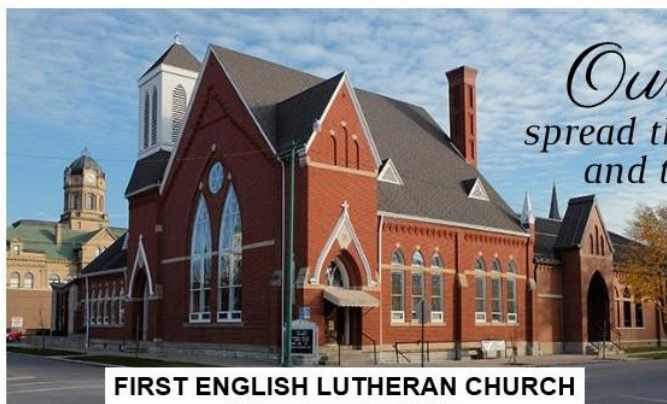
FIRST ENGLISH LUTHERAN CHURCH Wapakoneta, Ohio